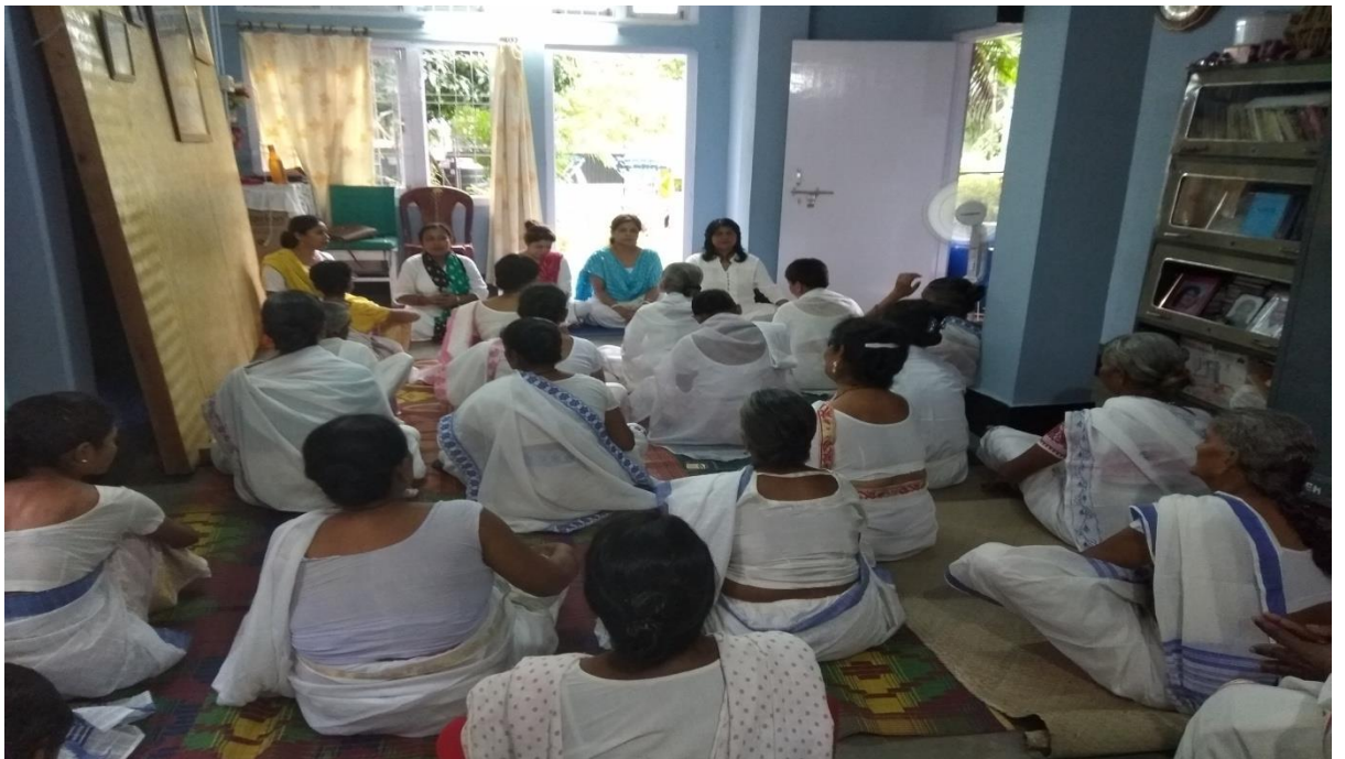
VIVEKANANDA KENDRA, ULUBARI