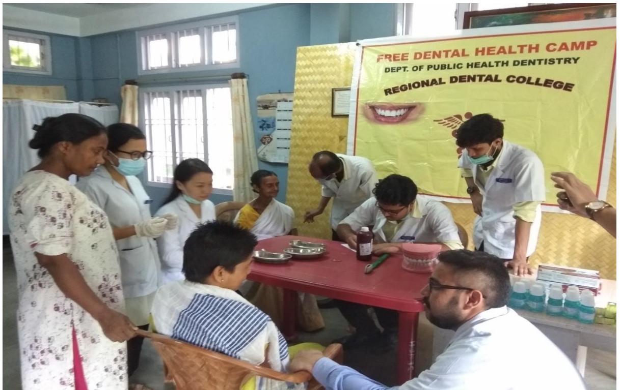
REGIONAL DENTAL COLLEGE