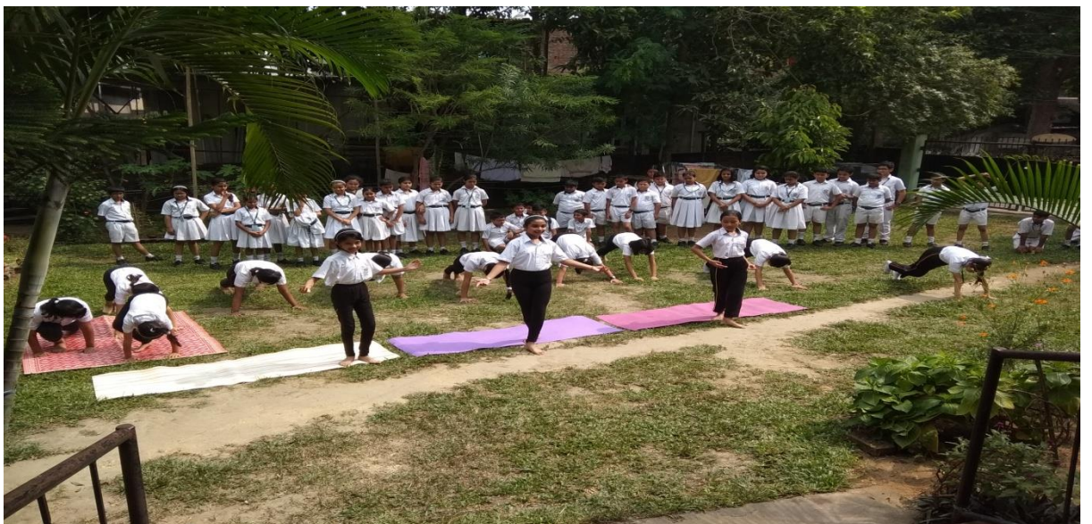
DELHI PUBLIC SCHOOL