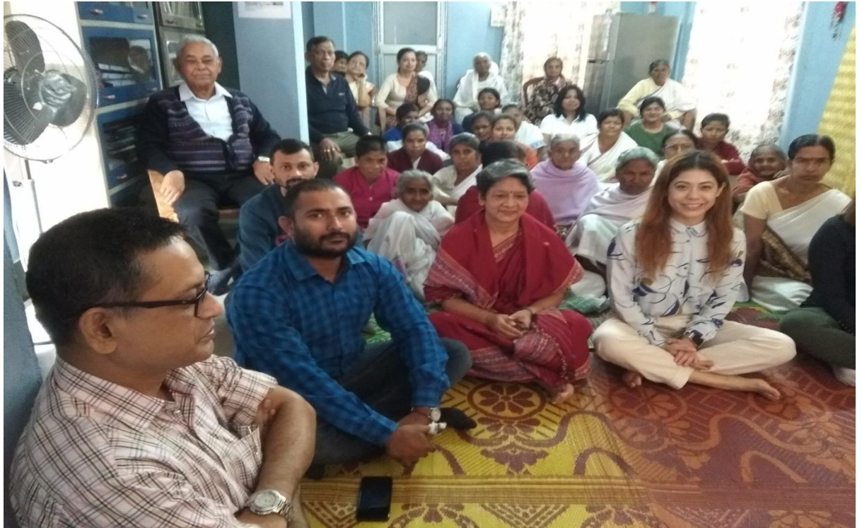
VIPASSANA MEDITATION CENTRE

14.Members of Vipassana Meditation Centre, Guwahati visited SENEH on 11/12/2019