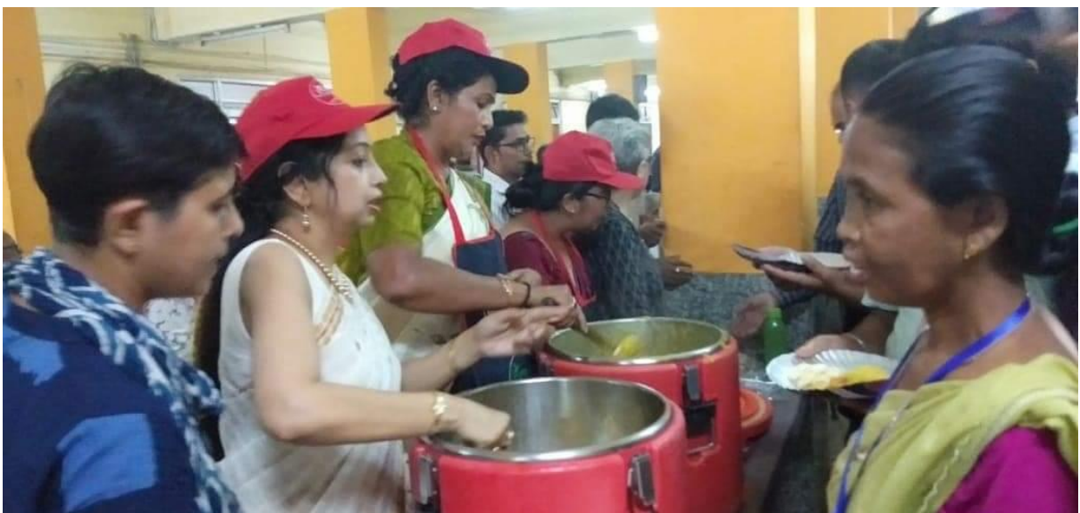
4. Our Trust distributed foods and essentials to the flood effected area near Marigaon District.