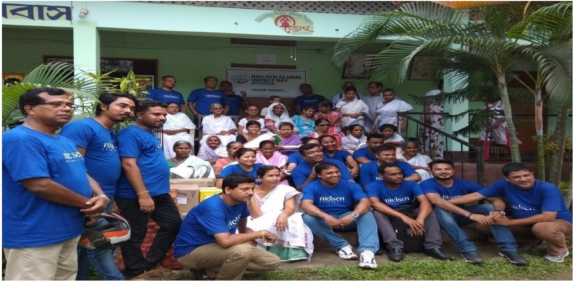
NIELSON INDIA PVT. LTD.