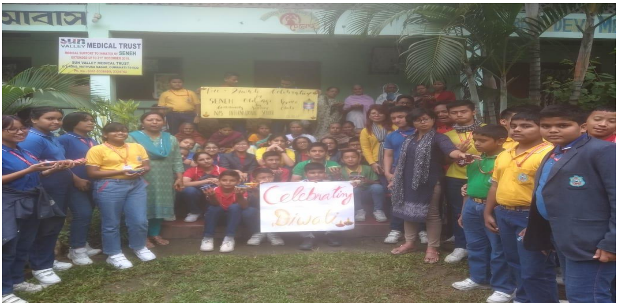
INTERNATIONAL PUBLIC SCHOOL