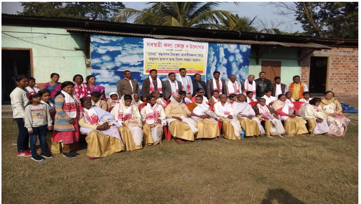
SARASWATI KALA KENDRA

15.Saraswati Kala Kendra ,Narengi celebrated New Year with our residents at their premises on 01/01/2020.