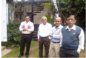
Local MLA with office barer